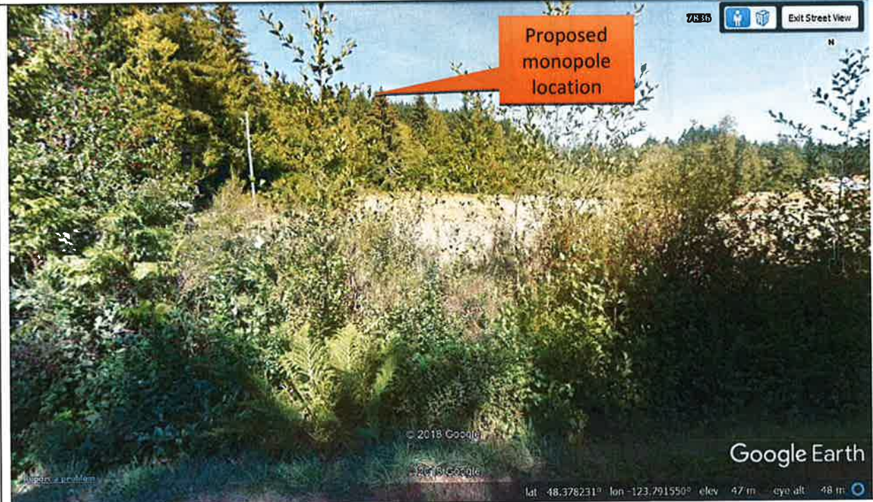
View: Looking west from Kemp Lake Road